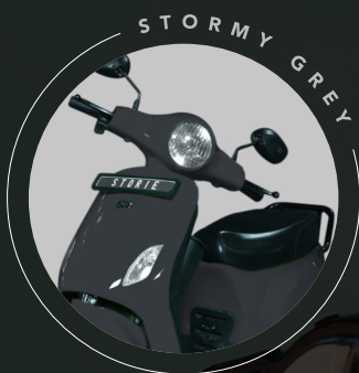
for the wild