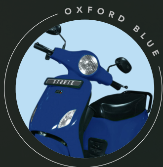
for the formal