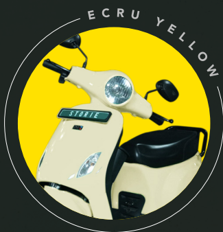
for the vibrant