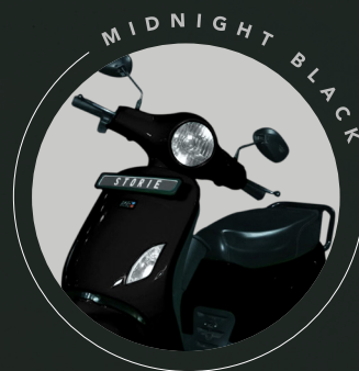
for the knights