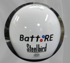
Helmet (comes in black & white)