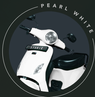
for the tranquil