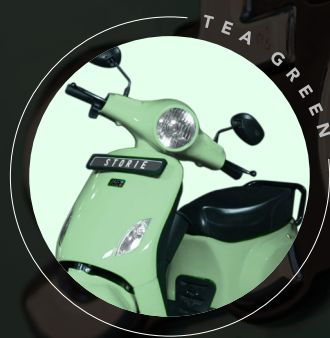
for the serene